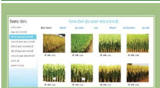
Bridging knowledge gap through ICT and decision support systems