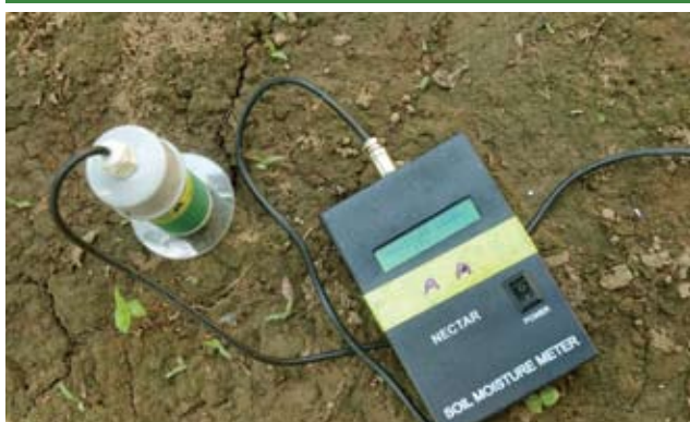
Developing digital technologies for accuracy and precision in agriculture