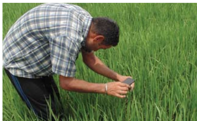
Promoting information technology in farming decisions