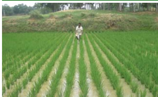
Optimising input use and productivity through System of Rice Intensification (SRI)