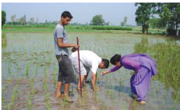
Saving water and energy through low-cost tensiometers