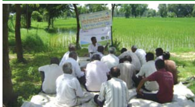
Building capacities of farmers for generating awareness and enhancing skills